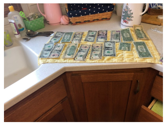
After visiting the drive-through window at the bank, we went home and "laundered" the money.

We have thoroughly wiped down everything that comes into the house, including each grocery item, the mail, papers and any delivered packages. After returning from