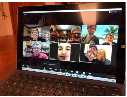
Our entire family was together via Zoom on Easter.