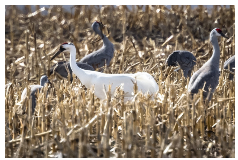
Tom White took this image of a whooping crane on March 25 at Elm Island Road, parallel to the Platte River. Tom shoots with a Nikon.