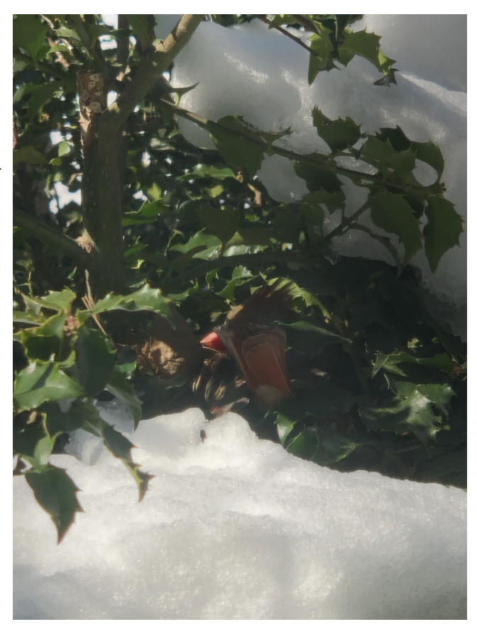
A female cardinal stays in place on her nest and enjoys the sunshine as the April snow melts around her.

Now she's back, almost all the time, so I assume there are eggs under her fluffed out feathers. I worried that the April 16 snow and cold would do damage to the mother or her forthcoming offspring, but it turned out her wise site selection meant that holly branches above her caught the snow and kept it off the bird family. Smart woman!