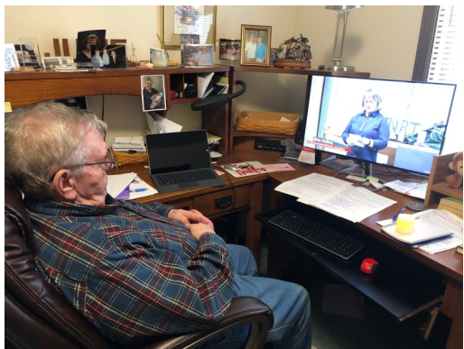
We have been worshiping online thanks to live streaming.

One of the pictures is from the day we watched our 5-year-old grandson learn to ride his bike. On Easter we Zoomed a family Easter meeting and had six pictures on our screen of our daughter, son-in-law, son, daughter-in-law and four grandsons (ages 5, 13, 19, 21). It was great fun to "be with them at a distance" for this special holiday. I've used the Zoom recording feature to read and record (with video) books for my grandson. So far I have read 18 books for him in that manner.