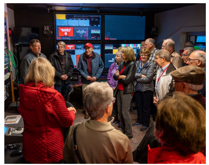
ERA members have a chance to see the HuskerVision headquarters at the stadium.