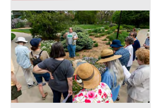
The UNL Maxwell Arboretum was the site of a 2022 OLLI tour.