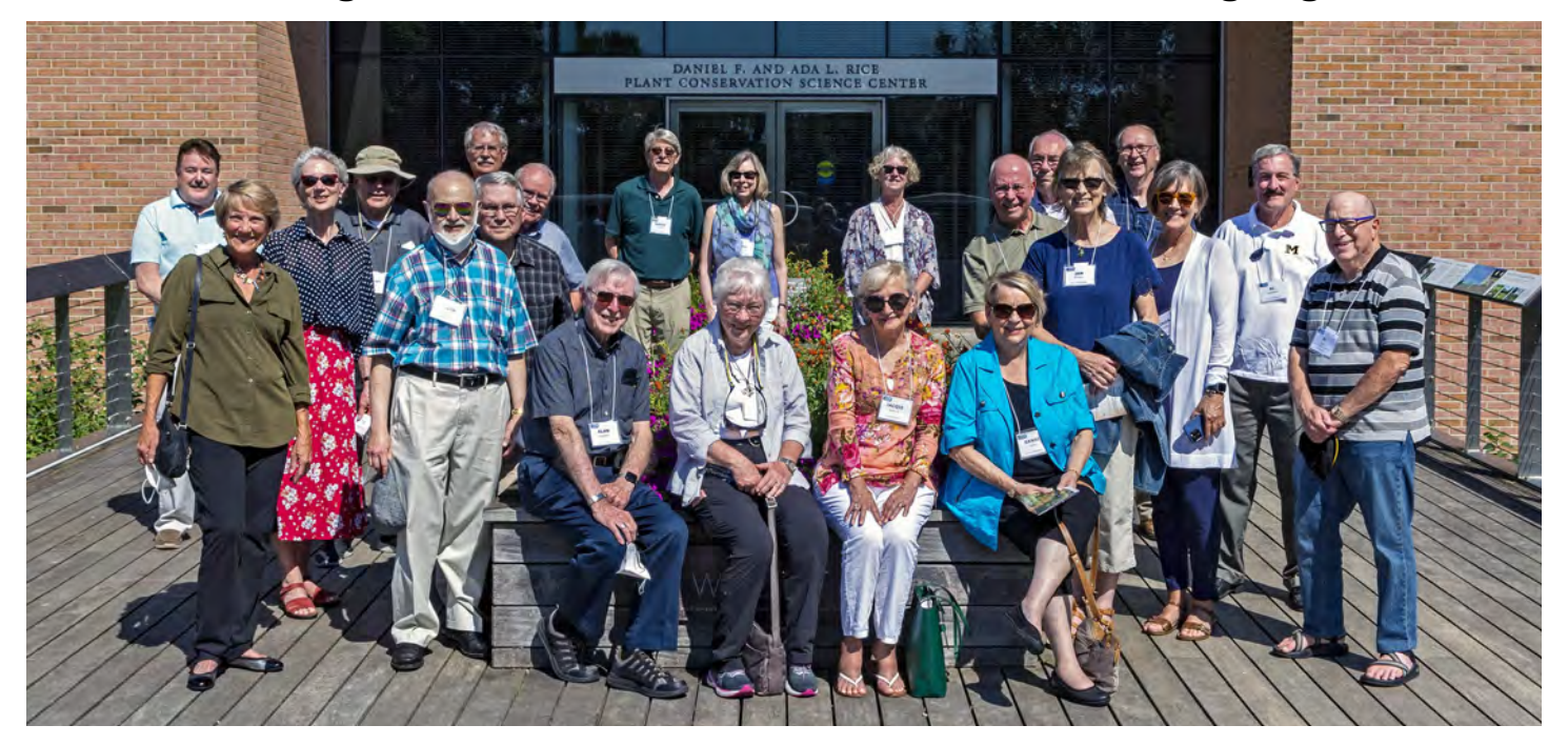
August 2022 conference participants outside Northwestern's Plant Biology and Conservation Program facility at the Chicago Botanic Garden