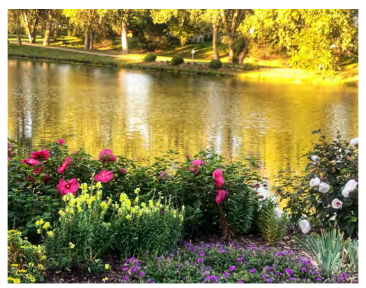
I like to walk to my "happy place" in the Lincoln Williamsburg area.

Favorite activity Number 1: I love to walk. During the pandemic, I built my almost daily walk up to 5 miles. I spent several months exploring Lincoln's trail system. Ultimately, I found my Happy Place to walk to ... a section on a trail in the Williamsburg area that features a man-made lake. It is about a 2.5 mile hike each way. I've set a goal of walking the equivalent of a minimum of 1,000 miles this year.