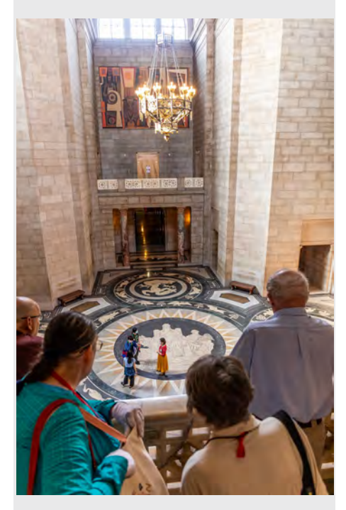
OLLI members participated in a 2021 "Fossil Walk" of mosaic pictures of fossils on the floor of the Nebraska State Capitol rotunda.