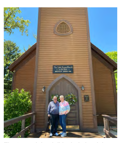
The "nostalgia trip" included a visit to the Little Brown Church.