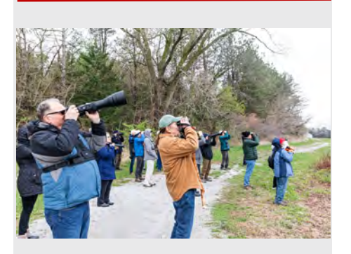
An OLLI group met for a birding experience in 2022.