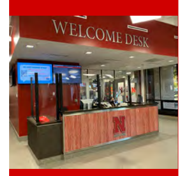
The group viewed the remodeled Nebraska East Union.