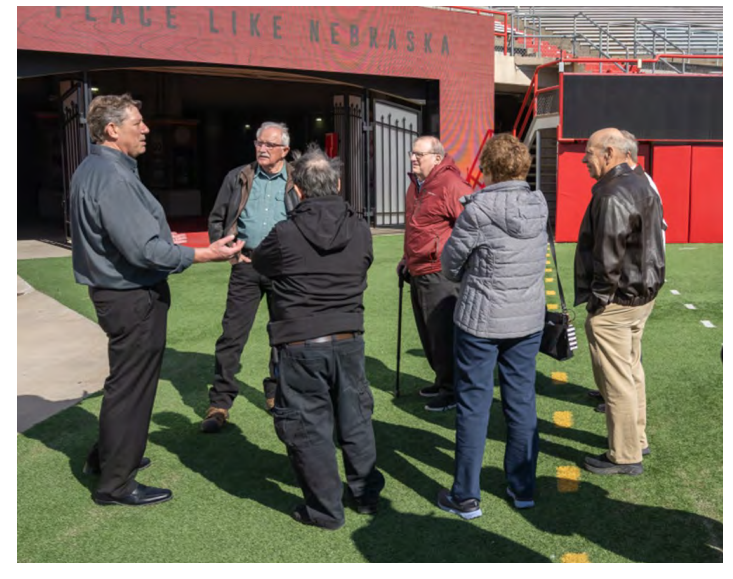
Athletics Department staff talk with ERA visitors on the field at Memorial Stadium.