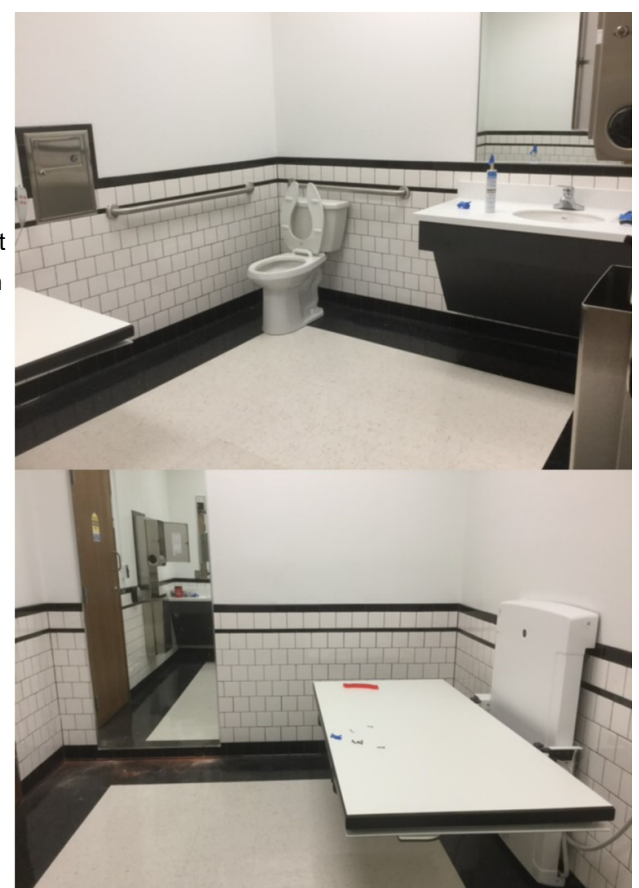
The Family Restroom on East Campus includes a changing table to assist adults with hygiene needs.

Those advocating for additional family-designated facilities hope they will be installed at athletic venues and centralized locations on all campuses in the near future as new buildings are erected and existing structures modified. Rita Weeks said that would be considered an important step in providing access for all Nebraskans.