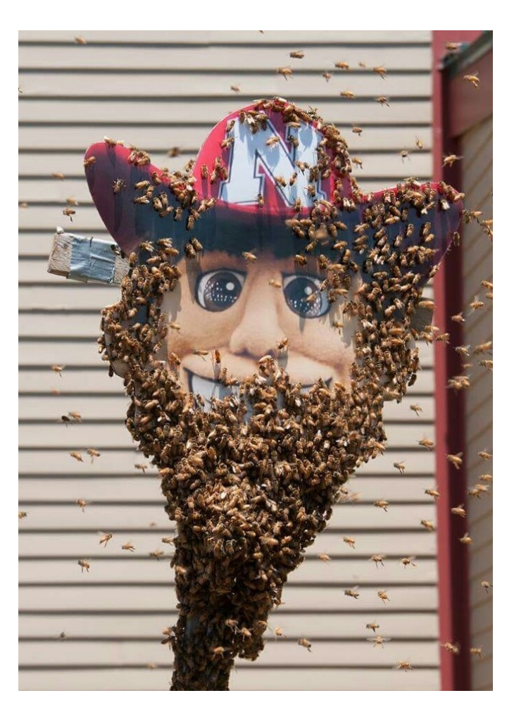
Herbie Husker Bee Beard at 2017 at BEE FUN DAY

https://www.unmc.edu/publichealth/departments/environmental/mead/